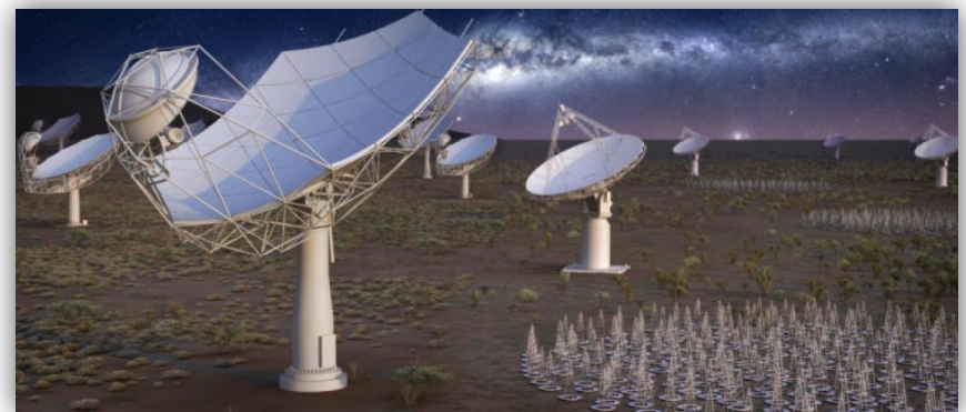
Square Kilometer Array (SKA)