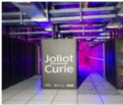
Joliot-Curie, GENCI@CEA, France