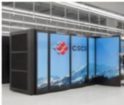
Piz Daint, ETH Zurich/CSCS, Switzerland