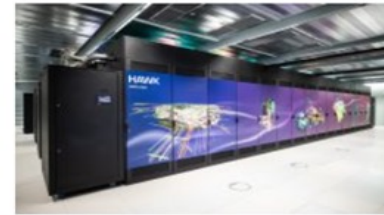
HAWK, GCS@HLRS, Germany