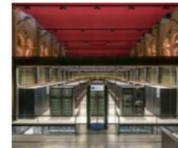
MareNostrum 4, BSC, Spain