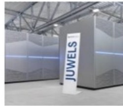
JUWELS, GCS@FZJ, Germany