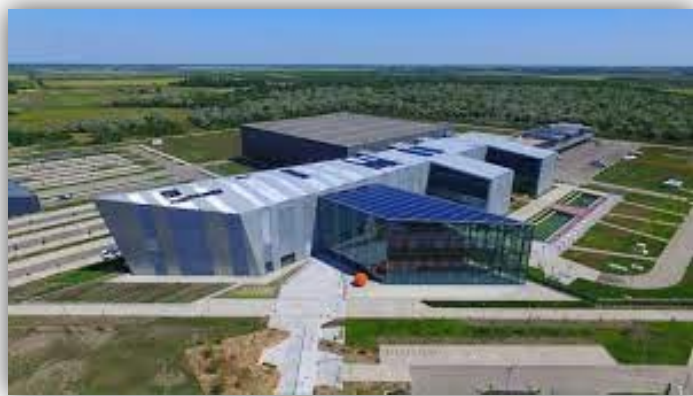
Extreme Light Infrastructure