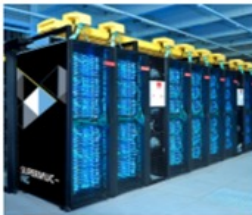
SuperMUC-NG, GCS@LRZ, Germany