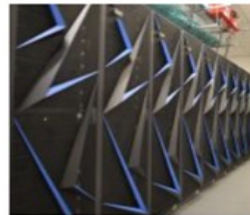
MARCONI, CINECA, Italy